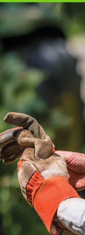
A New South Farm