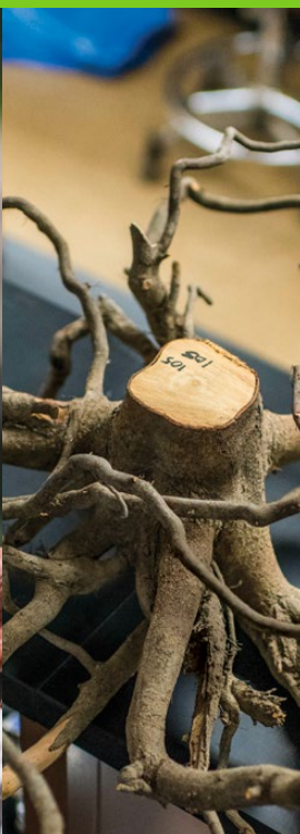
Center for Tree Science