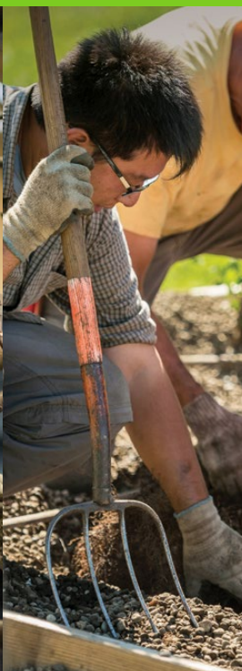
Tree Conservation Programs