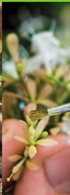
New Plant Development